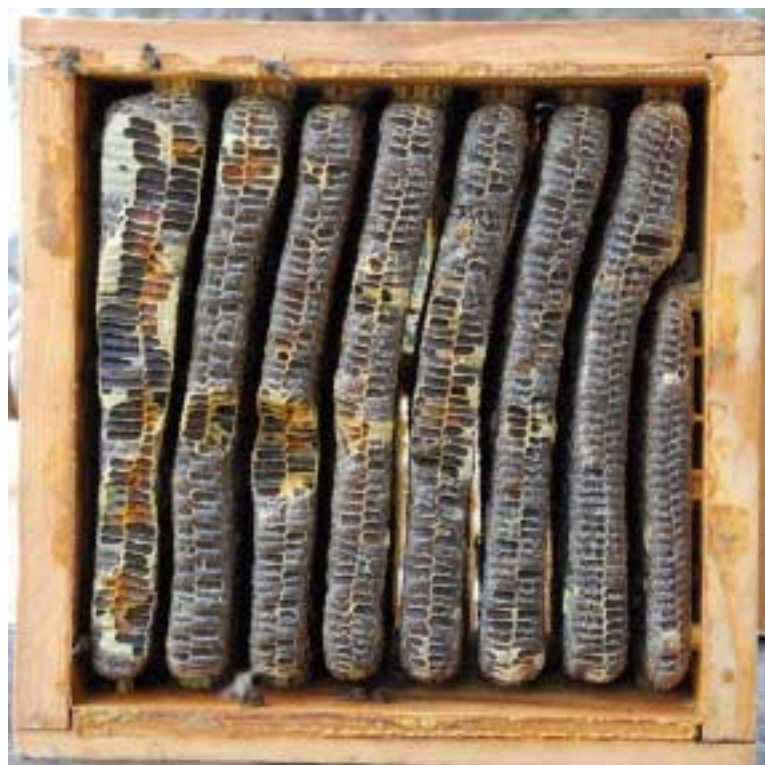
Figure 19. Honey harvest from a Warré hive

No bee escapes, blowers, fume boards, fumes, extra supers, uncapping knives, extractors or bottling tanks are needed when harvesting honey from a top-bar hive. With the horizontal format, bees are simply brushed off the combs and the comb cut into a bucket with a lid. With the Warré hive the bees in the topmost box are smoked into the one below with natural smoke. If the box contains little or no brood it is taken for harvest after making it bee tight for transport (Fig. 19). The next box is treated the same way and so on until the brood nest is reached. Honey is drained or squeezed from crushed comb. This avoids the exposure of fine droplets of honey to air as occurs in extractors and helps conserve the subtler aspects of flavour and bouquet.