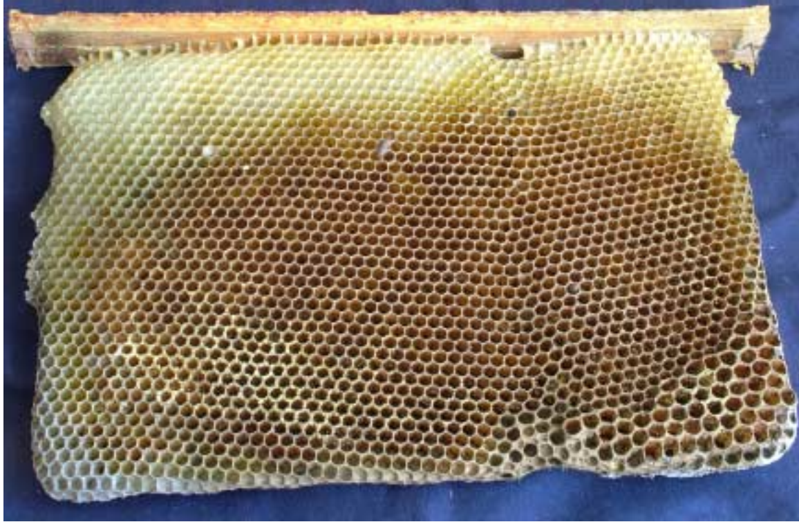
Figure 8. Warré vTBH comb with some drone cells bottom right.

'quilt' closed with hessian below and filled with any kind of plant fibre: straw, sawdust, shavings, leaves etc. This filling also absorbs and buffers water vapour flows and is changed each spring. The discarded contents are used to suppress weeds round the hive. The quilt rests on coarse-weave hessian that is in immediate contact with the top-bars. This is soon propolised and can be gently peeled off without annoying the bees. (This paragraph was unfortunately omitted from the version published in The Beekeepers Quarterly .)