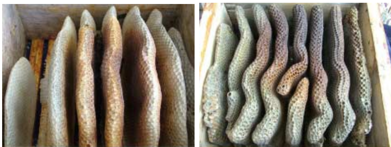
Figures 11 & 12. Natural comb in Warré hives viewed from below. Left: box only two-thirds completed (one broken comb); Right: filled box with some combs crossing to adjacent bars despite use of wax starter-beads on top-bars.

Most beekeepers will find it impractical to let the bees build entirely natural comb, for example by using, instead of frames, a perforated board or even top-bars without starter strips. Aside from the constraints of the cavity size and shape, the comb produced in this way has its architecture entirely determined by the bees, including comb spacing, cell size distribution and undulations. Beekeepers usually prefer to guide the bees' comb building to some extent. This can range from plain top-bars to top bars with a beading of wax along their undersides as starter (see Figs. 11 & 12), to top-bars with starter-strips of foundation, to frames with starter-strips of foundation, to frames filled with wired foundation.