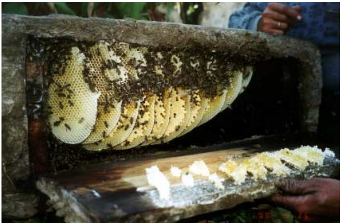
Figure 9. Colony in side-access log hive, Jumla, Nepal.