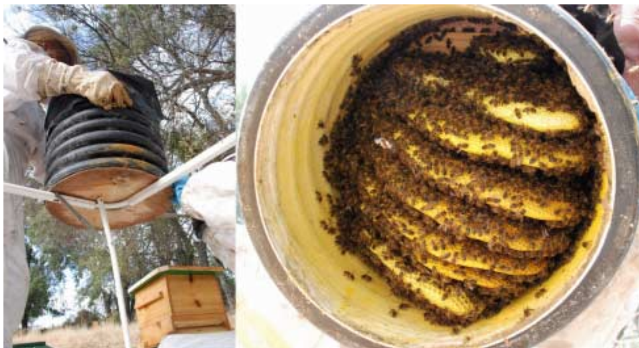
Figure 21. Drainpipe bait hive

It is not always practicable or safe to take a swarm, for instance if it is high in a tree. So in order to minimise losses of swarms, some inexpensive bait hives can be distributed in the vicinity of the apiary and inspected frequently. Ideally the hives should be in an elevated prominent position at about 3 m from the ground, 300 m or more from the apiary, have a volume of about 40 litres and an entrance size of about 12 square centimetres 54 . It should also smell of bees. This can be achieved by coating the inside with beeswax and the entrance area with propolis. Bait hives have been made from all sorts of containers. An ingenious solution involving a piece of drainage pipe from which the swarm can be simply lifted and transferred to a Warré hive is shown in Figure 21.