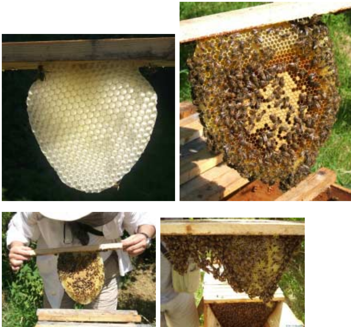
Figures 4-7. hTBH combs: new comb on top-bar (top left); comb with brood below (top right); examining a new comb already with brood (bottom left); wax makers building comb (bottom right).

nest heat retention principle and may offer at least an interim solution in countries where the law requires combs to be very easily removable and replaceable.