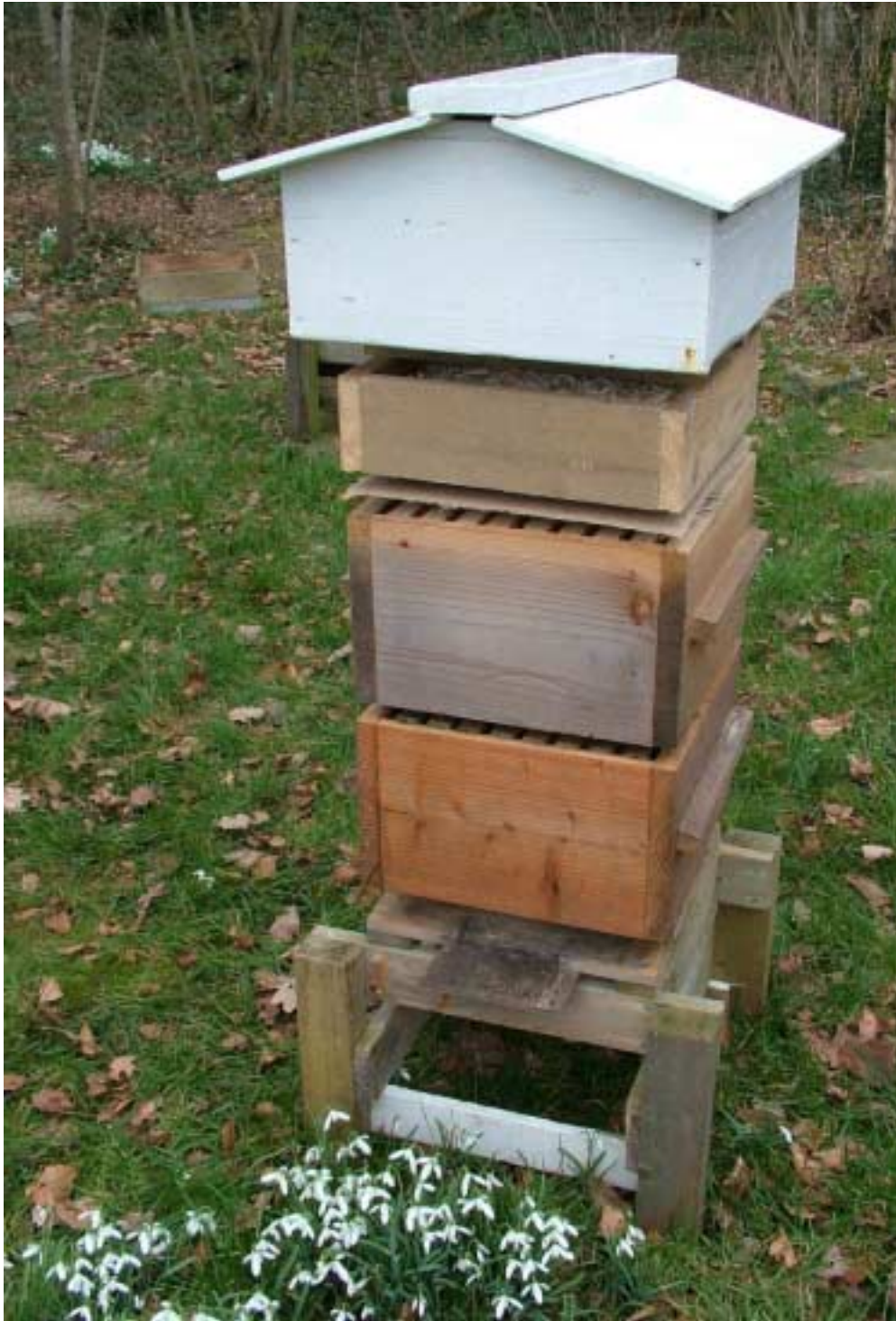
Figure 3. 'Exploded' view of The People's Hive of Abbé Emile Warré showing a stand, the floor with alighting board, two hive elements with top-bars, the top-bar cover cloth, the quilt filled with wood shavings and the roof.

For my being made fully aware of the implications of framed beekeeping, I am indebted to books by Johann Thür 9 and Abbé Warré 8 . Thür gives a persuasive argument for observing the principle of retention of nest scent and heat ( Nestduftwärmehindung ) in hive design and resurrects the hive of Abbé Christ (1739-1813) which was identical in concept to Warré's. Later in this series of articles I will discuss a type of frame, originally designed for a Warré hive, that minimises violation of the