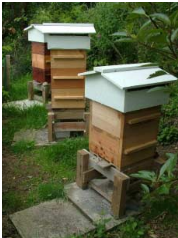
Figure 16. Garden apiary of three Warré hives

Let us encourage extensive, i.e. low-intensity, beekeeping carried out by a larger population of beekeepers and made possible by much simpler equipment that requires far less intervention. 'Small is beautiful'. Top-bar hives, especially that of Warré, make an increase in small-scale beekeeping a real possibility.