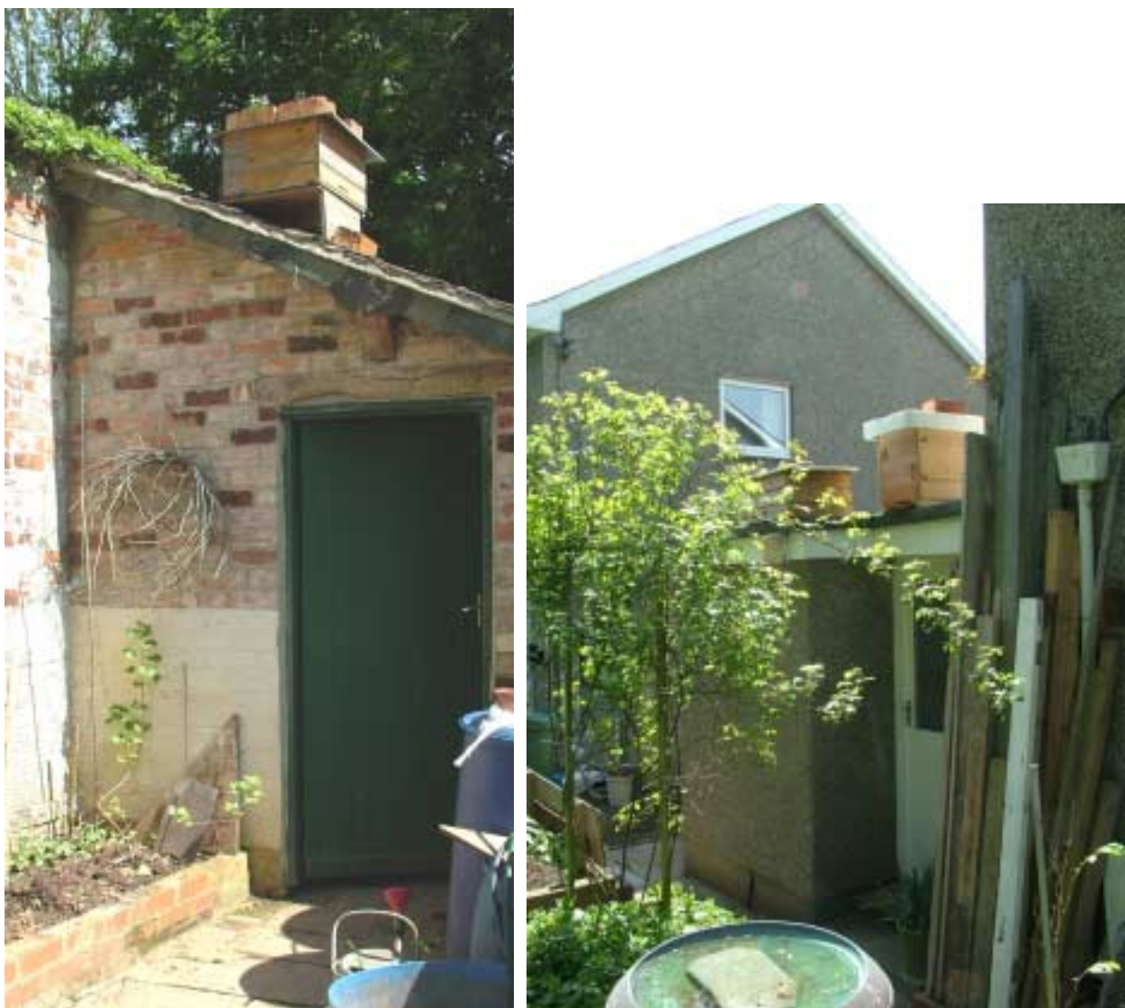
Figures 13 & 14. Bait hives: (left) made of recycled tongue-and-groove timber prominently sited on the roof of a garden shed ; (right) two Warré boxes in use as a bait hive with another bait hive of recycled timber to their left.

An empty element at the bottom of the colony also allows disturbance during feeding to be minimised. A container of feed can be placed on the floor. No heat is let out of the brood nest. Indeed, the colony appears rarely to notice the intrusion.