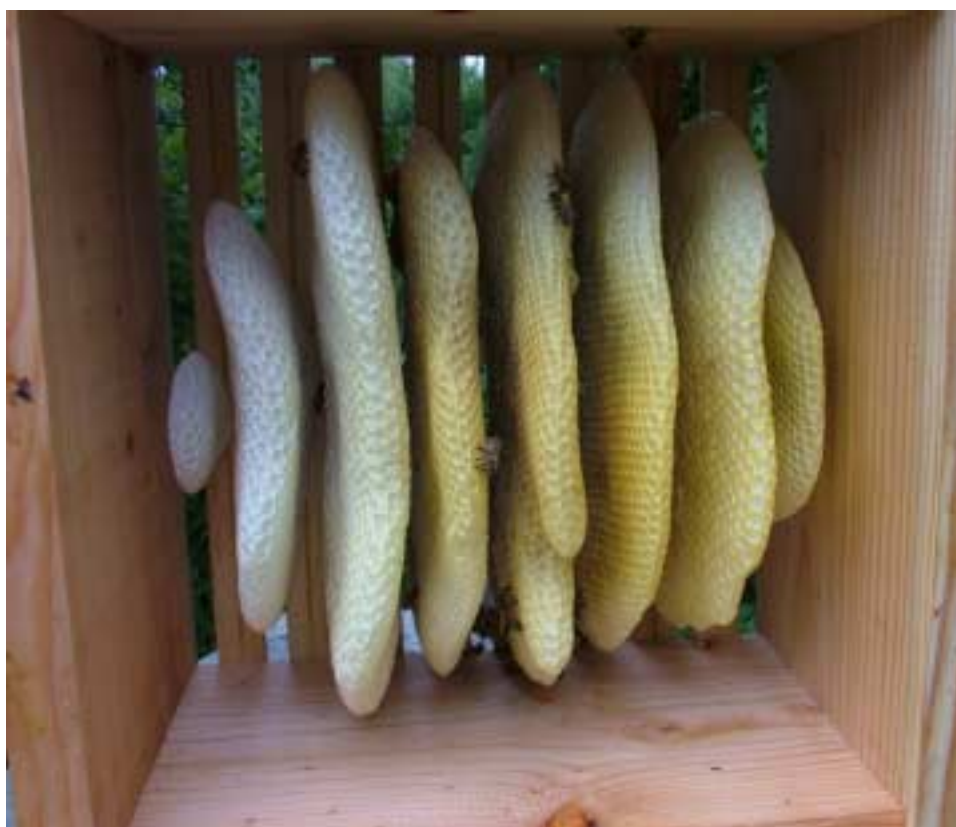
Figure 17. New natural comb in a Warré hive box

If chemicals have to be used just to keep colonies alive while co-adaptation is taking place then it needs to be part of integrated pest management, i.e. monitoring Varroa burdens and treating only when absolutely necessary and at the most appropriate time. The organic acids are preferable for their documented low residues. Essential oils, such as thymol, are less acceptable because of their absorption into wax. But any intervention just further postpones the achievement of co-adaptation. European beekeeping has not yet had to deal with the challenge of small hive beetle (SHB). It appears that strong colonies with no crannies to hide in will cope with the SHB challenge. Top-bar hives with their natural comb may prove well suited to this.