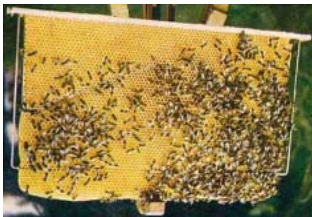
Figure 18. Delon frame

There are also beekeepers in countries where the law requires combs to be easily movable. Although top-bar combs can be removed and replaced, more care is needed and the inspectors may not take too kindly to having to go through an apiary full of top-bar hives. In which case, a compromise is available, especially with the Warré hive. Roger Delon developed a modified top-bar on which was fixed a 'U' shape of 3 mm stainless-steel wire that surrounds the remaining three edges of the comb 30 . The wire is 'invisible' to the bees to the extent that it eventually becomes embedded in the comb and the natural retention of nest heat is safeguarded. The only objections to this on the grounds of sustainability is that stainless-steel has a high ecological footprint and the construction of Delon frames increases the complexity and cost of the operation (Fig. 18). The all wooden half-frame of Gilles Denis is another option which came to my attention after writing this article 56 .