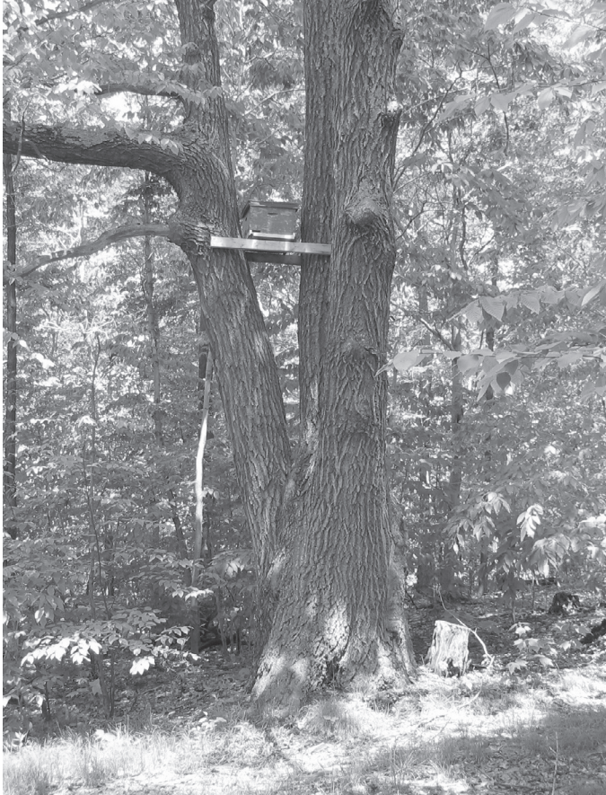
Figure 1. One of five bait hives installed in trees in the Arnot Forest to attract swarms and so provide feral colonies living in movable-frame hives. Installation shown is typical: hive mounted some 4 m off the ground and with entrance opening reduced to 16 cm 2 and oriented to south.

not by themselves indicate a living colony within – they could be robber bees or scout bees, plundering or inspecting the nest of a dead colony – so I used the criterion of the presence of pollen foragers as my indicator of a live colony. The nests of colonies that had died were kept in the inspection program to provide data on the occurrence of nest reoccupation. The May 1 inspection preceded the swarming season for the Ithaca area (Fell et al., 1977), so all colonies alive at that time were assumed to have survived the winter. The mid-June inspection served to check for late spring mortality among colonies that survived winter. The October 1 inspection provided data on nest reoccupation and colony survivorship for the preceding summer. A prior study of the demography of feral colonies in central New York State (Seeley, 1978) found that